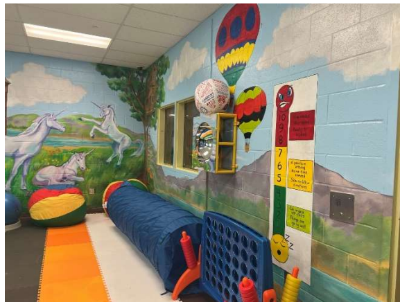
Recreation Room (Boys and Girls Club)